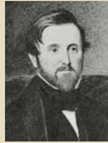
Alexander Jackson Davis

Blithewood, part of Bard College since 1951, is a contributing property in the Hudson River National Historic Landmark District. The estate