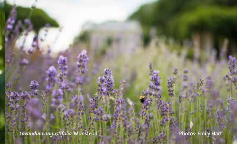
Lavandula angustifolia 'Munstead'