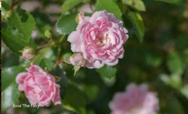
Rosa 'The Fairy'