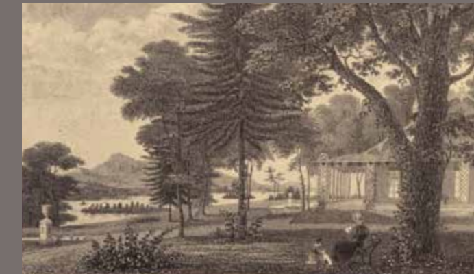
View of the Blithewood grounds in A. J. Downing’s Treatise on the Theory and Practice of Landscape Gardening , 1841.

Blithewood’s lawn and woodlands also contain remnants of vegetation that date from the original estate. A former New York State Champion red maple, known as the “All Saints” maple, still stands on the north lawn. Twin black locusts on the south lawn are approximately 300 years old. Along the woodland edges, significant ground covers of periwinkle and pachysandra and large forsythia may represent plantings from the 19th and early 20th centuries.