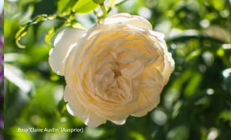
Rosa 'Claire Austin' (Ausprior)