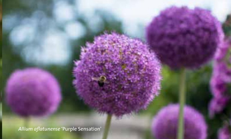
Allium aflatunense 'Purple Sensation'